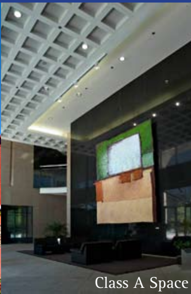
Class A Space