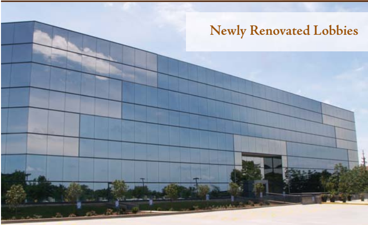
Newly Renovated Lobbies